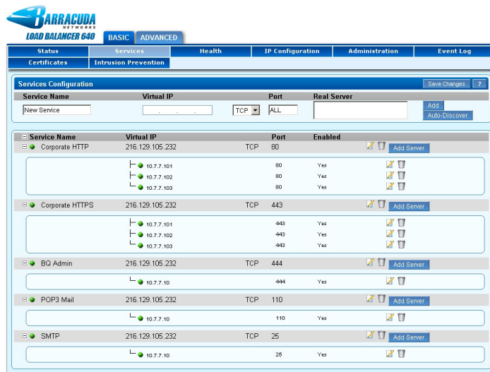
The Barracuda Load Balancer distributes traffic for multiple services, including Web, email, and other network applications.

The Barracuda Load Balancer's integrated service monitor ensures that servers and their associated applications are always operational. In the event of server or application outage, the Barracuda Load Balancer facilitates automatic failover among servers to ensure continuous availability. To mitigate risks associated with failures of the load balancers themselves, two Barracuda Load Balancers can be deployed in an active/passive configuration.